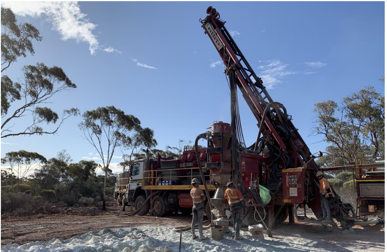
The drill rig on site at Bulong Taurus yesterday